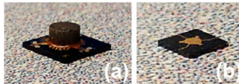
Figure 2 (a) Conventional ferrite circulator; (b) self-biased ferrite circulator